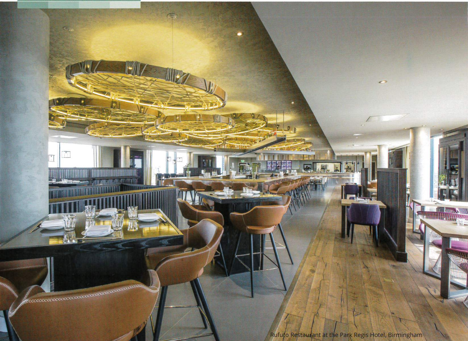
Rufuto Restaurant at the Park Regis Hotel, Birmingham